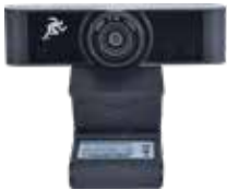
DigitalInx USB Webcam with 90° Field of View (DL-WFH-CAM90)

Liberty's DigitalInx USB webcams are available in two different options with varying FOV: 90° standard-view angle or 120° ultra-wide view. Both camera options share the same features which include 1080p/30fps image sensor, tripod mount, security cap and built-in microphone. Designed to capture video & audio for conferencing and other applications such as streaming, webinars, distance learning, lecture capture, or personal chatting.